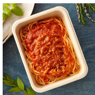
Classic Spaghetti with Meat Sauce