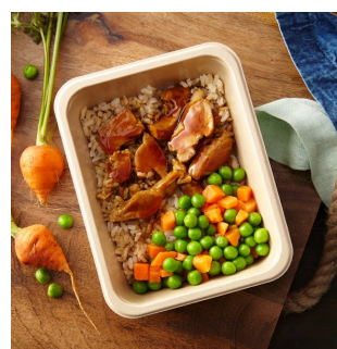
Teriyaki Chicken Rice Bowl

Take a break from making lunch. Order a box for your child to enjoy a different entrée each day of the school week. Need to skip a week? No problem. Our program is flexible to fit your needs. Save yourself some time and order today!